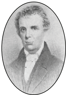
Barton W. Stone

The body of Christ, crucified on Calvary, is represented by the one bread or loaf, and Christians united in one body are joint partakers of it. The New Translation is precisely according to the original text. Thus; “The cup of blessing